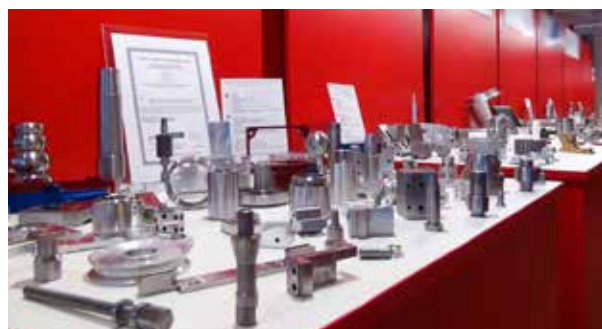
Buyers in SOH Area Stuttgart*

*Due to confidentiality reasons, the suppliers names are not shown on the picture.